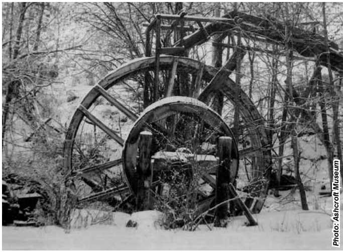
Flour & Saw Mill

mill, whose millstones are the oldest in British Columbia, supplied flour.